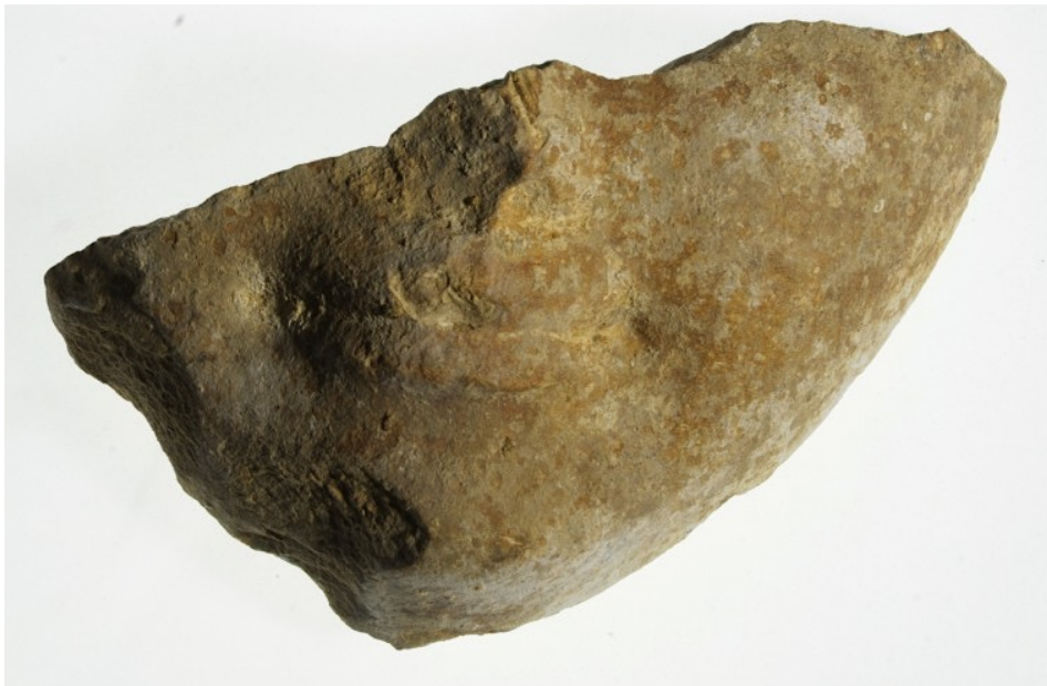
Fig. 11: a fragment of an hathoric capitel