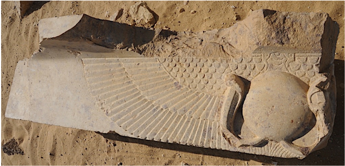
Fig. 6: door lintel with winged solar disk.