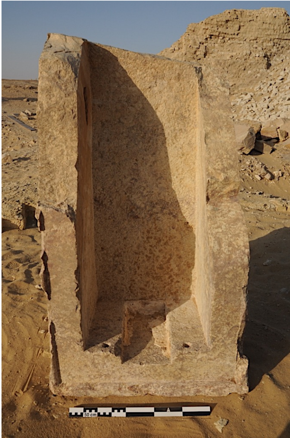
Fig. 8: lower part of a limestone naos .