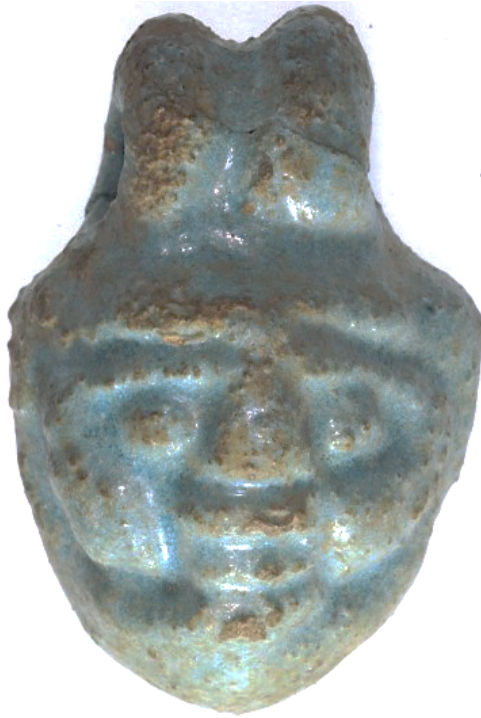
Fig. 10: amulet in faience .