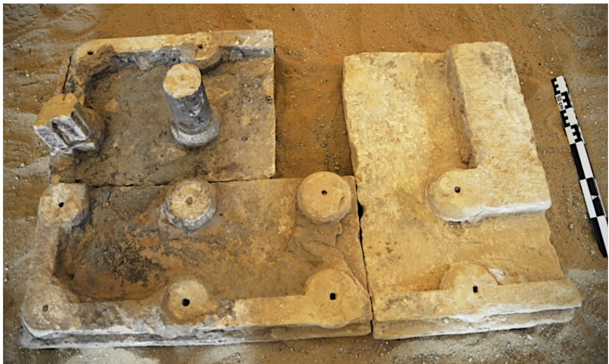
Fig. 7: model in stone of the the temple ST 203.