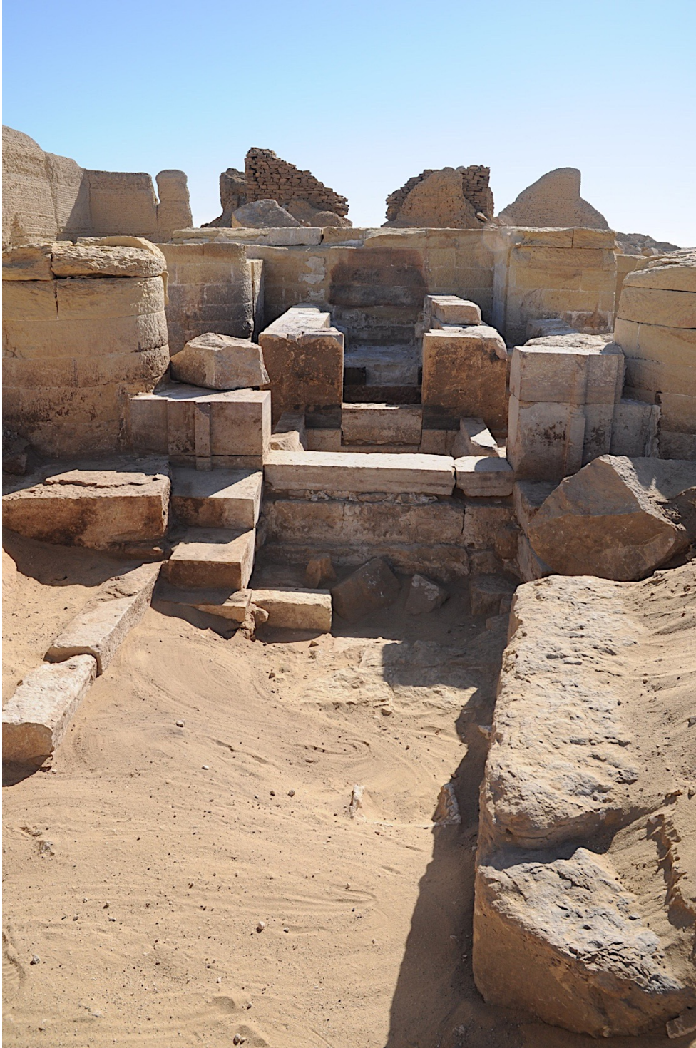
Fig. 5: naos in ST 203, view looking south.