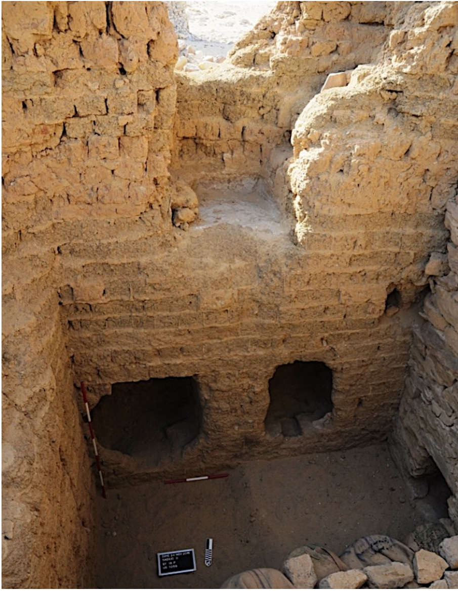
Fig. 9: room P in temple ST 18.