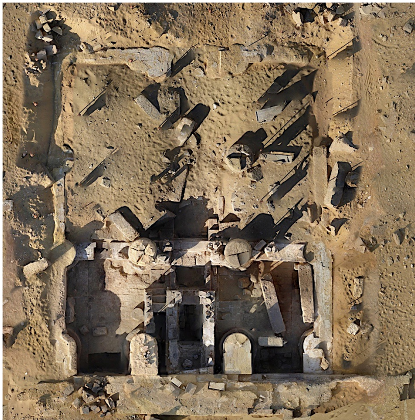
Fig. 4: mosaic zenithal photograph of ST 203.