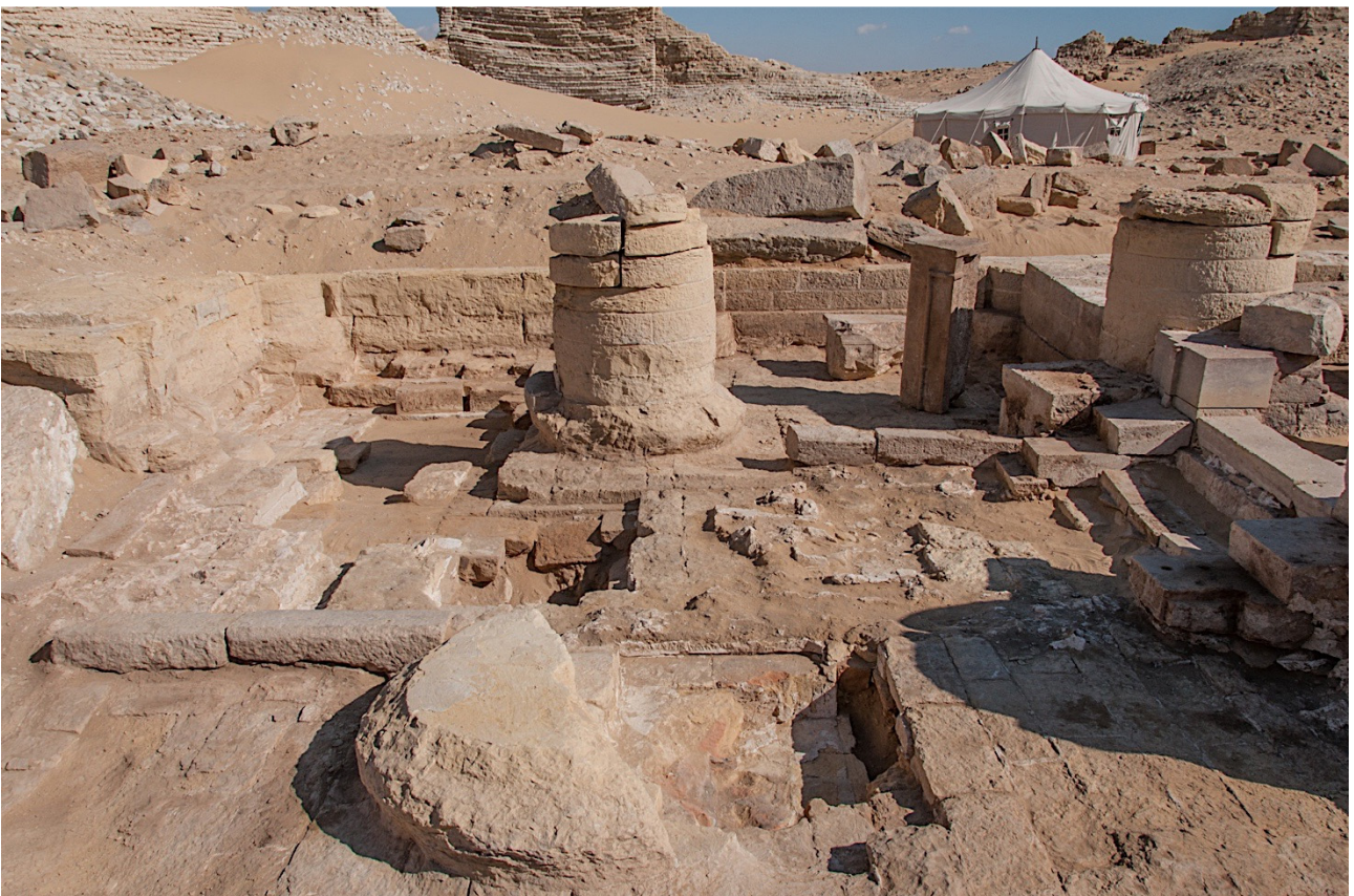
Fig. 5: view from West to East of room E.