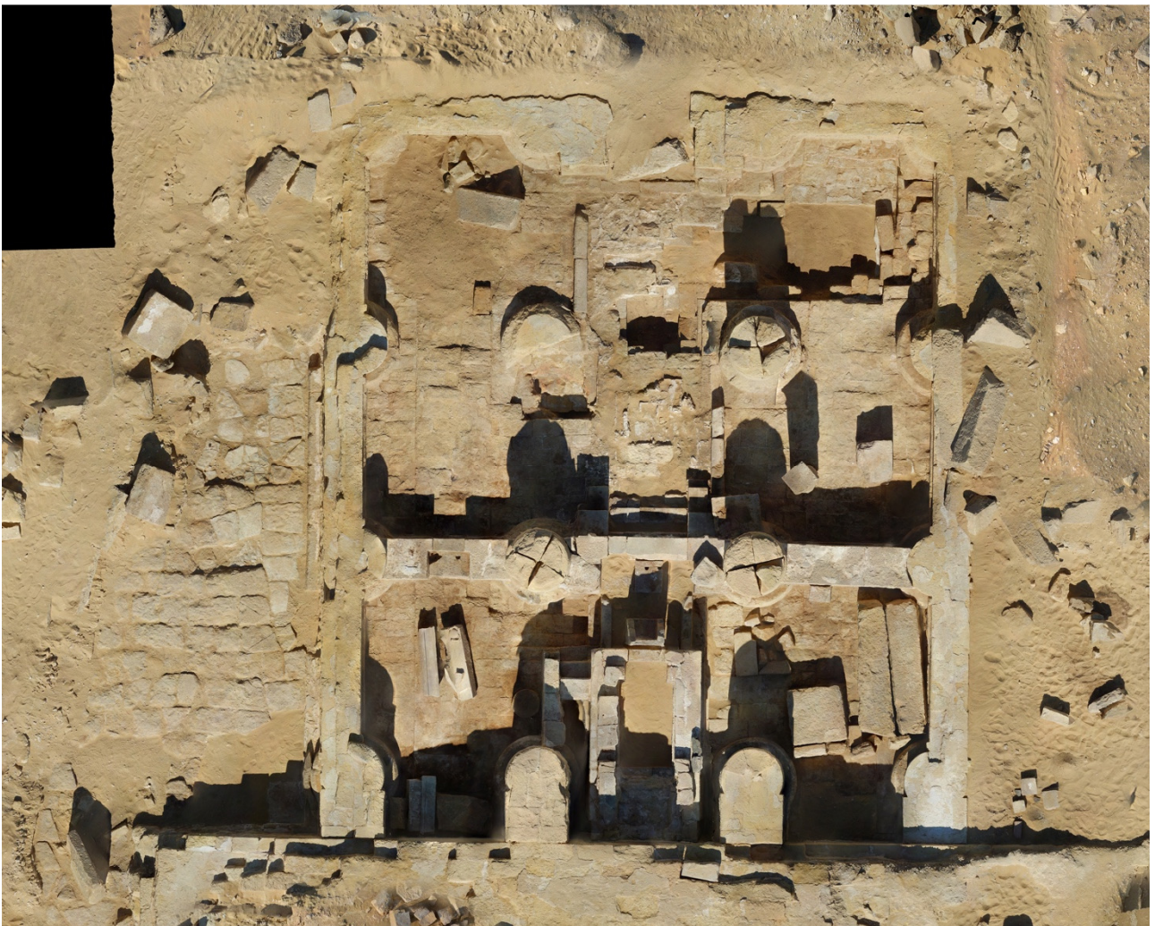
Fig. 3: orthophoto of ST 203 at the end of the excavation.