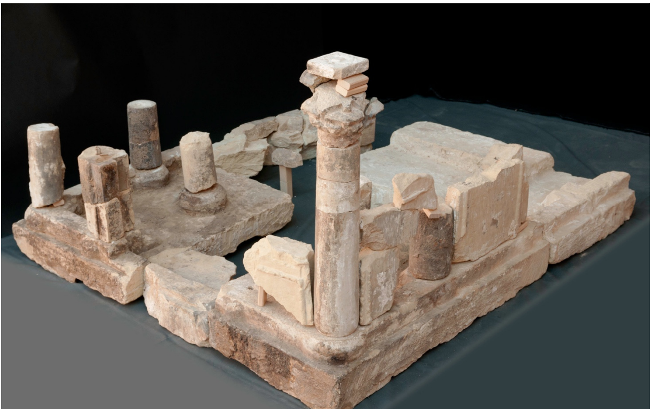
Fig. 9: architectural model of ST 203.