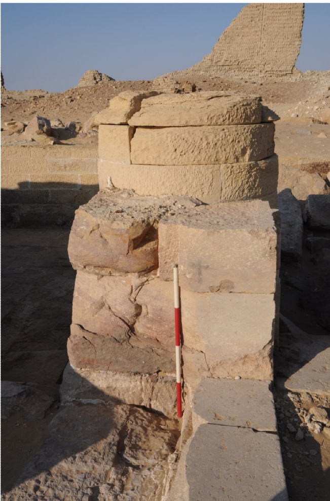
Fig. 7: cross in black ink on the West jamb of the door between rooms E and A.