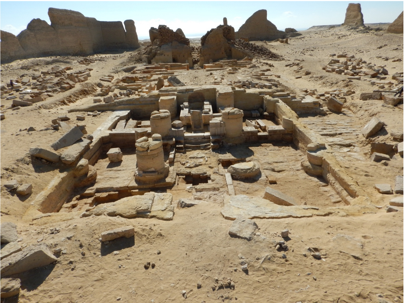
Fig. 4: view from North to South of the contra-temple .