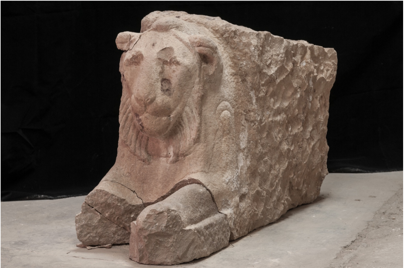
Fig. 8: lion for gutter.