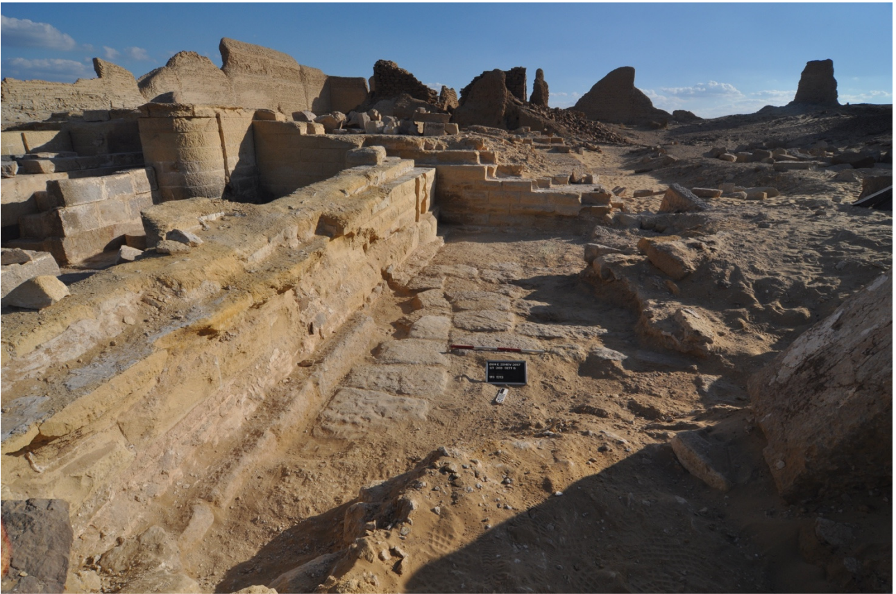
Fig. 6: floor west of ST 203.